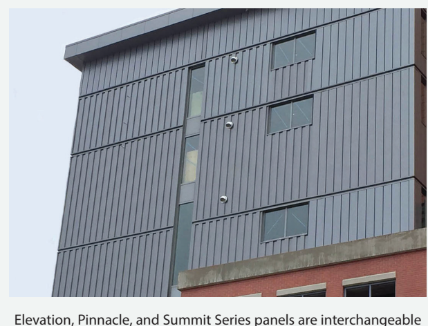
Elevation, Pinnacle, and Summit Series panels are interchangeable with the Proprietary WaardLok Fastening System. It is designed to guard against wind-driven rain and wind uplift.