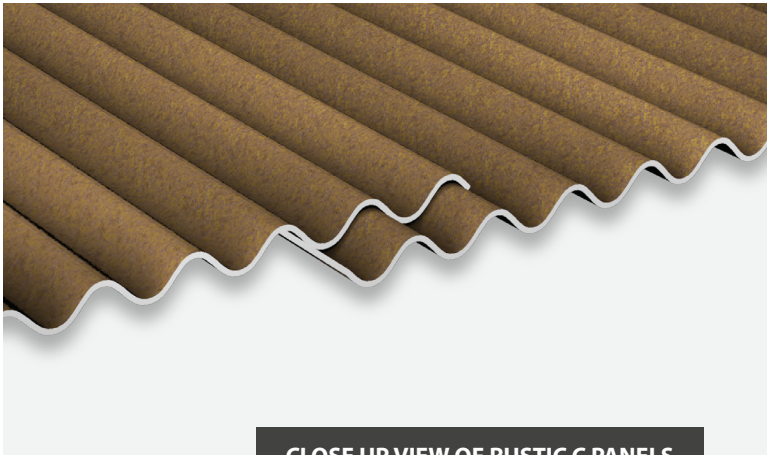
CLOSE UP VIEW OF RUSTIC C PANELS