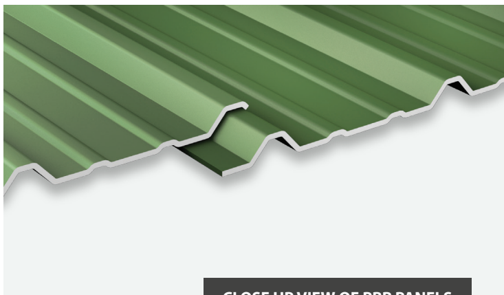
CLOSE UP VIEW OF PBR PANELS